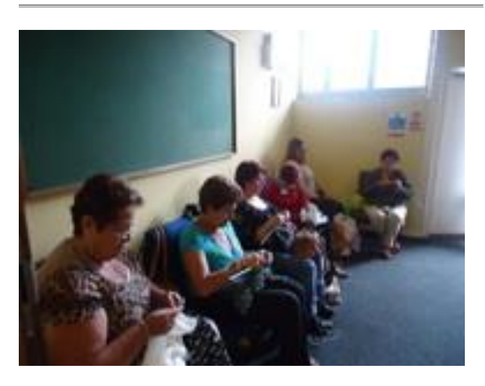
Health & Safety workshop